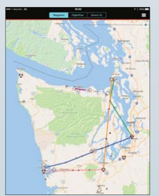
RS-AERO1I map screen example

Preprogrammed waypoints can be exported to an Android /iOS device and plotted on an map application.